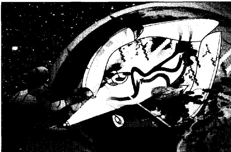
Figure 1. The bio-cybernetic earth model as second Copernian revolution (Schellnhuber, 1999).